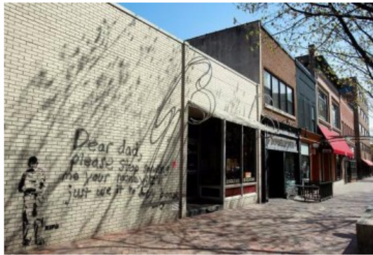
Graffiti reading 'Dear Dad, please stop sending me your money. I'll just use it to buy booze.' is spray painted on a wall next to the Sauce liquor store on the Pedestrian May 2.

The City Council is scheduled to vote Tuesday on a $50,000 contract with Virginia-based Divaris Real Estate to assess the downtown market, with an emphasis on how the University of Iowa affects the area. The UI would pay for half of the cost.