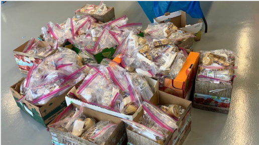
Sandwiches, sandwiches, and more sandwiches!